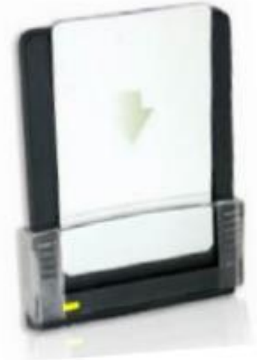
Available Wall Mount