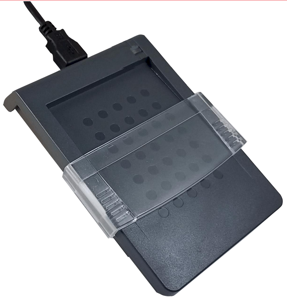
XPressUHF USB Desktop UHF Reader

XPressUHF is a fully customizable, multi-purpose UHF encoding solution compatible with Windows or Mac OS computers that can quickly read and write UHF tags, parse, and display tag data.